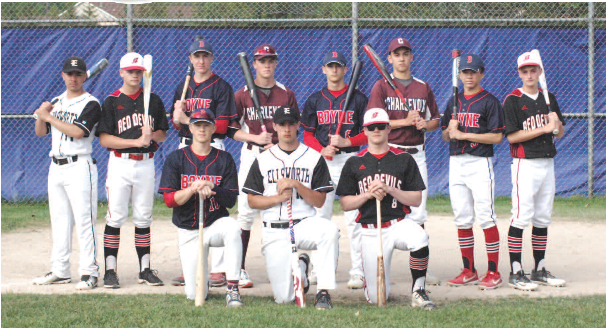
The 2019 Charlevoix County News All-Area Baseball "Dream Team".